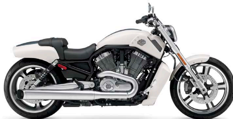
VRSCF V-Rod Muscle® A Brawny Bruiser with High Torque and Raw, Meaty Power