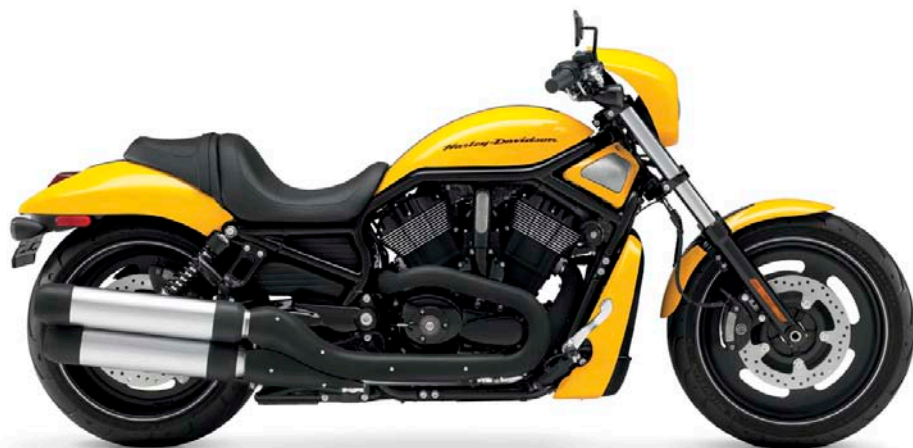
VRSCDX Night Rod® Special Long and Low with Blacked-Out Street Styling and Massive Power